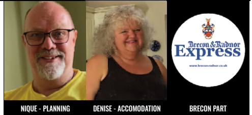
NIQUE - PLANNING