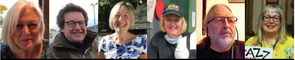
GILL - ATRIUM USW